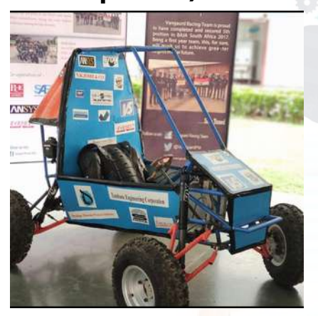
Gumkhana (Workshop Shed)